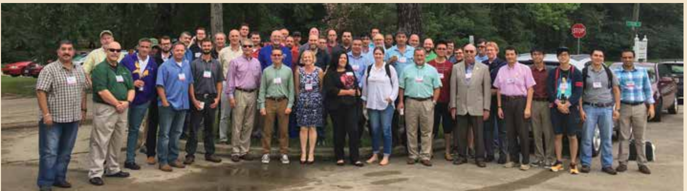
In August, TTC hosted the first Utility Investigations School (UIS), developed with ASCE's Utility Engineering and Surveying Institute (UESI). It was a five-day course which provided students the knowledge and tools to provide competent utility investigations in accordance with accepted national standards.

In August, TTC hosted the first Utility Investigations School (UIS), developed with ASCE's Utility Engineering and Surveying Institute (UESI). It was a five-day course which provided students the knowledge and tools to provide competent utility investigations in accordance with accepted national standards. The course