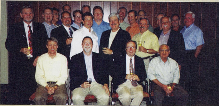
The Industry Advisory Board at a recent gathering.